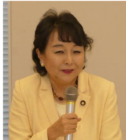
Ms. Kuniko Inoguchi, Member of the House of Councillors