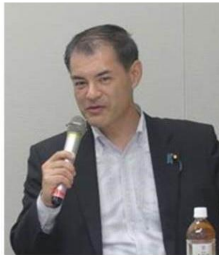
Mr. Masahiko Shibayama, Former Minister of Education, Culture, Sports, Science and Technology