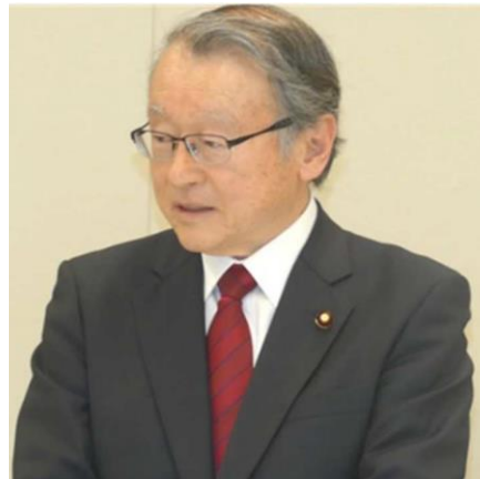
Mr. Masaharu NAKAGAWA

Parliament Member from LDP, former Deputy Minister for Cabinet Office