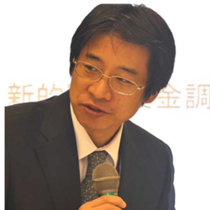
Mr. Susumu Kuwahara, Councilor Ambassador, International Cooperation Bureau, Ministry of Foreign Affairs