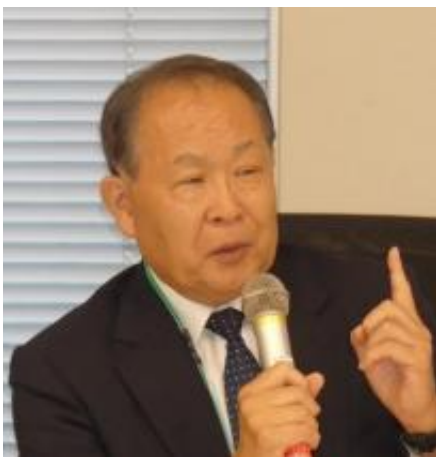
Mr. Minoru GENDA, former major general and professor at National Defense Academy