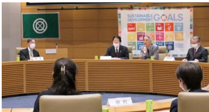
Mr. Bunmei IBUKI Former Speaker of the House of Representatives