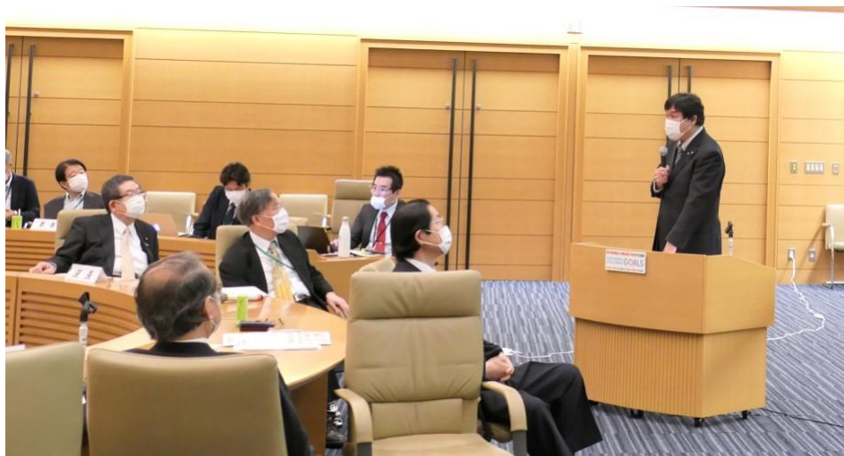
Mr. Hideo ONISHI, member of the House of Representatives, explained that the Edogawa Ward had