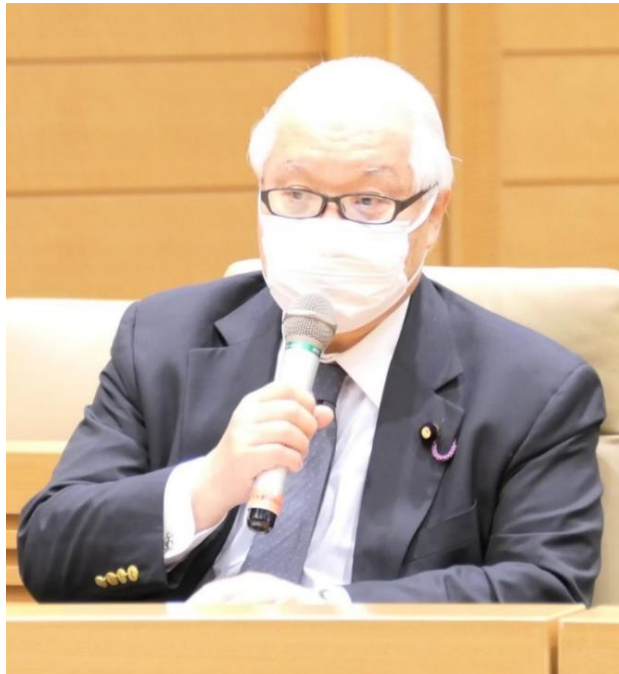
LDP, Mr. Keizo TAKEMI, Member of the House of Councillors

Mr. TAKEMI, Chairperson of the Subcommittee on Governance for Infectious Diseases and Special Committee on Global Health Strategy of the Liberal Democratic Party of Japan and the UHC Goodwill Ambassador to the World Health Organization (WHO) expressed his views on the importance of international cooperation.