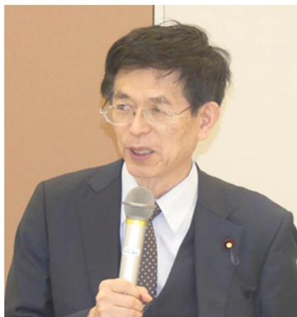
Mr. Takashi Shinohara

Member of House of Representatives, former Minister of Education, Culture, Sports, Science and Technology