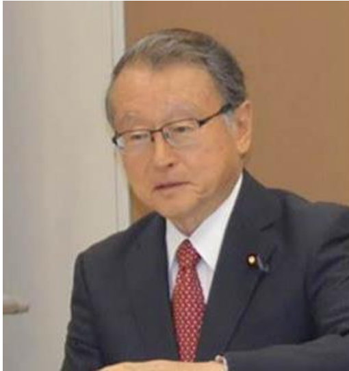
Mr. Masaharu NAKAGAWA, former Minister of Education, Culture, Sports, Science and Technology