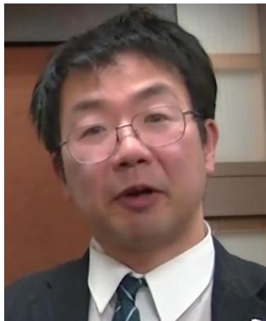
Mr. Osamu SHIOHAMA

5) Establish a bipartisan team made up of parliamentarians from two countries whose “common language” is English in order to activate the bilateral parliamentary alliance with national parliaments.