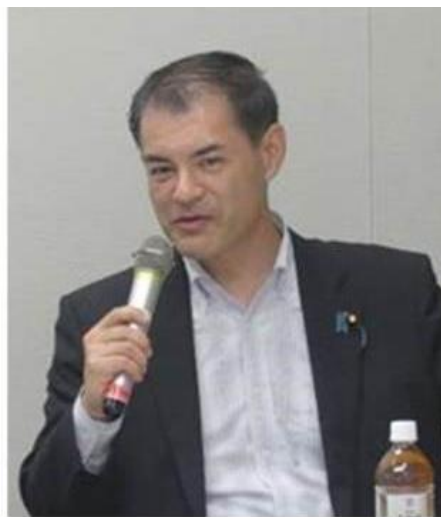
Mr. Masahiko Shibayama, Former Minister of Education, Culture, Sports, Science and Technology