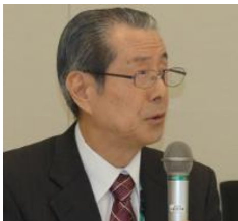
Ambassador Yasuyoshi KOMIZO

between that of international organizations depending on contributions and that of those depending on solidarity taxes. Solidarity tax is important for establishing transparent and democratic governance. Funds are needed to solve environmental problems, and measures such as solidarity tax should be considered to cover contributions. Mr. UEMURA suggested to add financial issues as Recommendation 5.