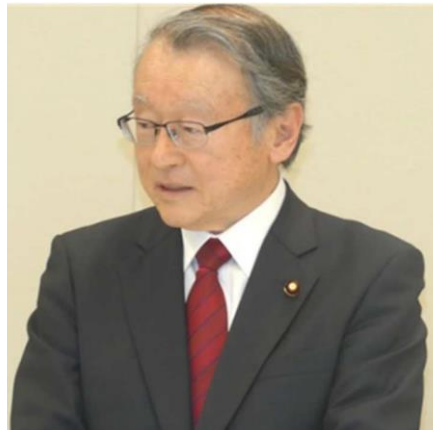
Mr. Masaharu NAKAGAWA

Parliament Member from LDP, former Deputy Minister for Cabinet Office