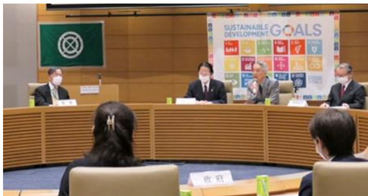
Mr. Bunmei IBUKI Former Speaker of the House of Representatives

Mr. Seishiro ETO, the Chair of the Parliamentary Committee of the Japanese Diet for the World Federalist Movement, explained how world-renowned scholars and scientists