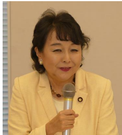
Ms. Kuniko Inoguchi, Member of the House of Councillors