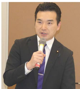
Mr. Tetsu Asano, Member of House of Representatives, NDP