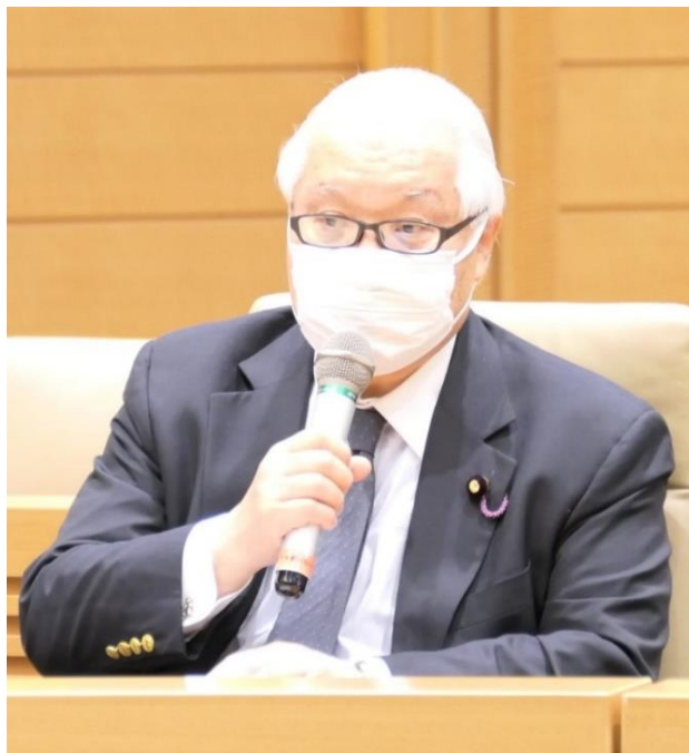
LDP, Mr. Keizo TAKEMI, Member of the House of Councillors

Mr. TAKEMI, Chairperson of the Subcommittee on Governance for Infectious Diseases and Special Committee on Global Health Strategy of the Liberal Democratic Party of Japan and the UHC Goodwill Ambassador to the World Health Organization (WHO) expressed his views on the importance of international cooperation.